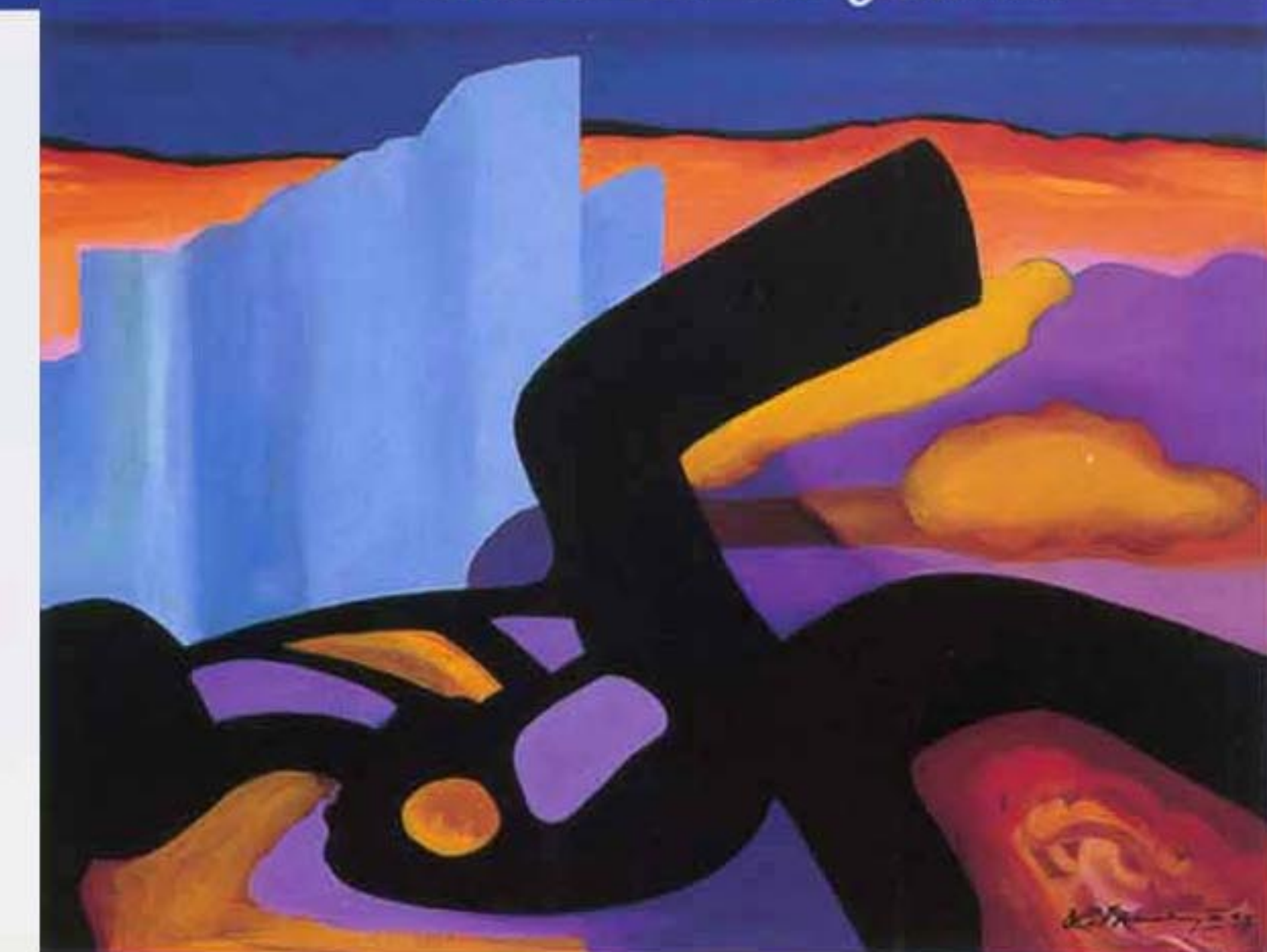
TOP: Lovers in a Park, Acrylic on Canvas