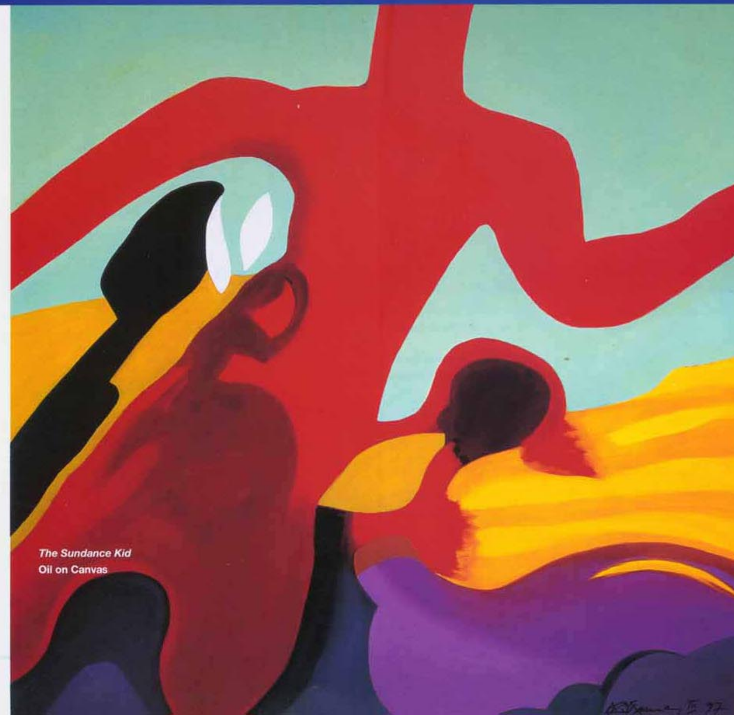
The Sundance Kid Oil on Canvas